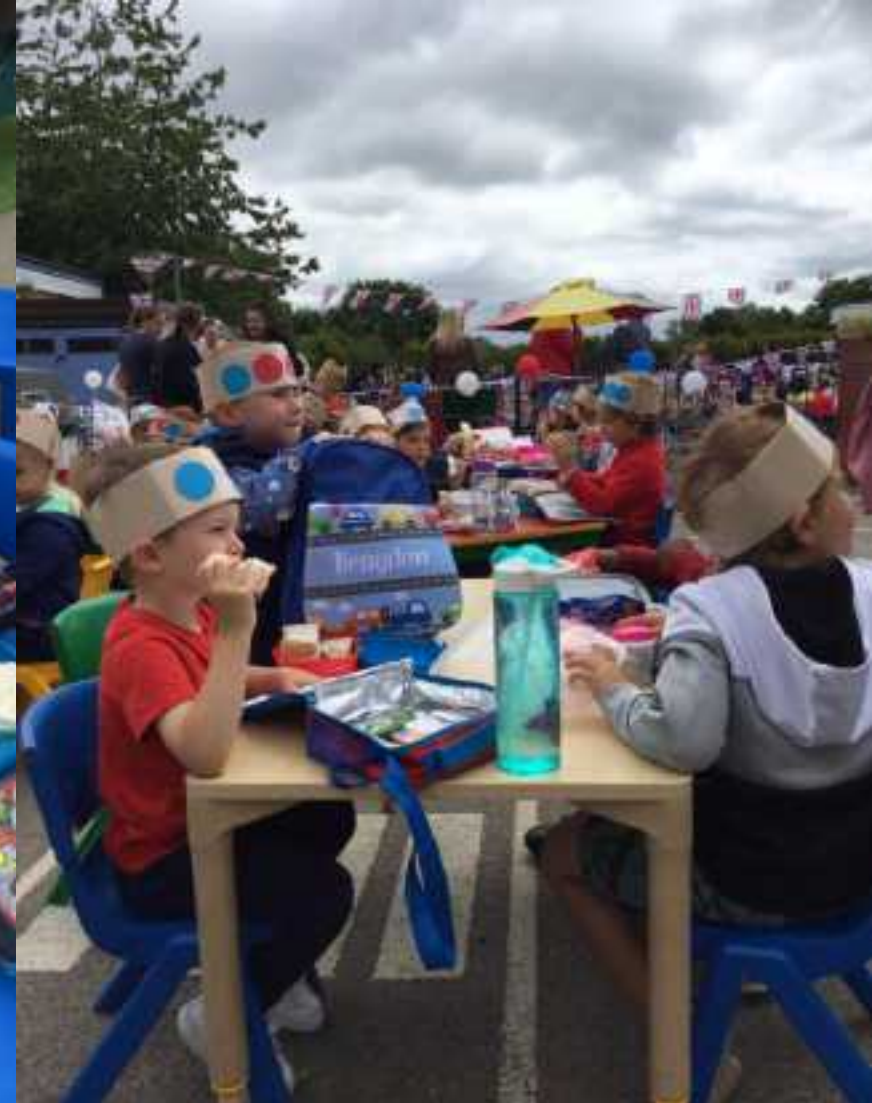
Nursery enjoyed their Jubilee party too!