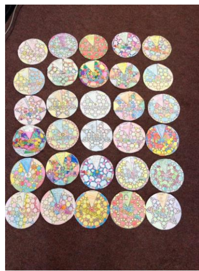
Y3 taking notice