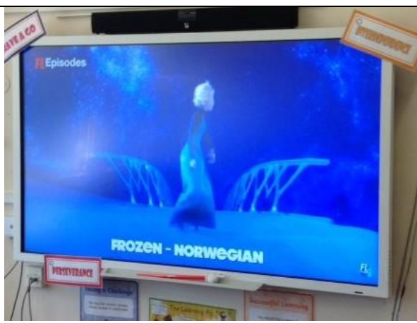
Singing in other languages