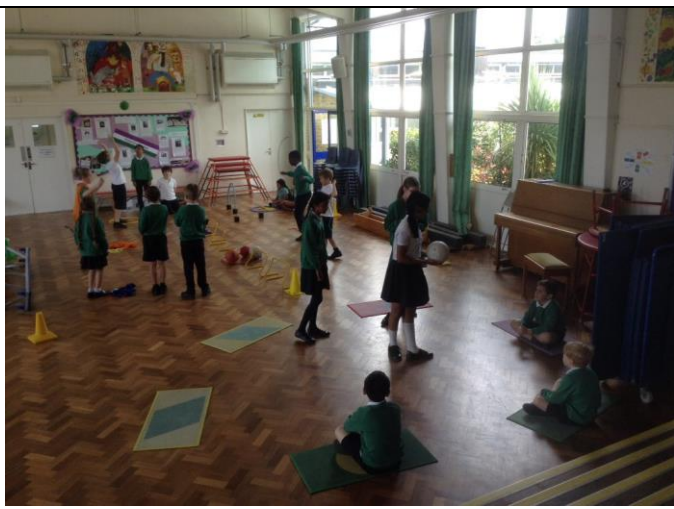
Y5 designed games to play with Y2