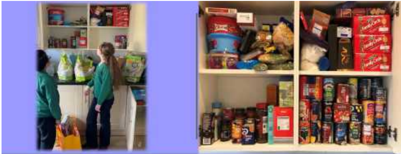
Y6 MPs have been stocking up the St. Vincent de Paul Society, Bedwell cupboards after your generous FoodBank Friday collections last week.